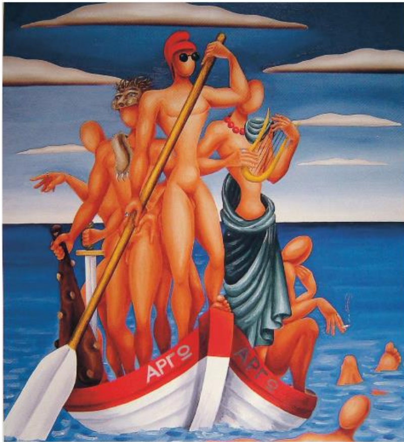
Nikos Engonopoulos, Argo (1948)